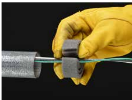
Positioning the wires

Polywater® FST™ MINI is an expanding, quick-setting, "closed-cell" foam that is injected into a conduit to provide a watertight seal. The seal is superior to pliable duct putties and "open-cell" aerosol canned foams. Recommended for small conduits (less than 1.5 inches (40 mm)).