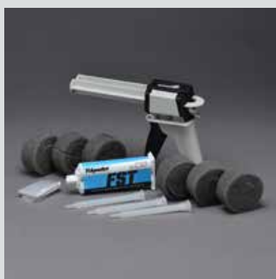
Catalog # FST-MINI-1G