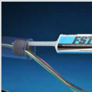
Insert nozzle past the first dam