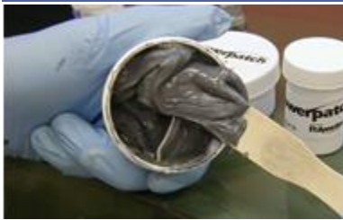
Mix 2-part paste sealant to a uniform grey color