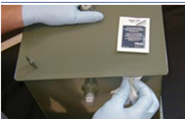
Clean area with cleaning wipe before applying sealant

For an active leak, apply Putty Stick to temporarily stop flow. If there are no active leaks, go to instruction 4.