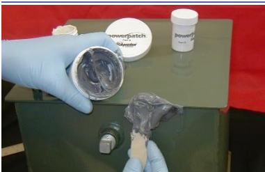
Apply PowerPatch over putty patch or leak area

Empty all the contents of the Part B Cup into the larger, Part A Cup. Mix for about 1 to 2 minutes until the mixture is a uniform gray color.