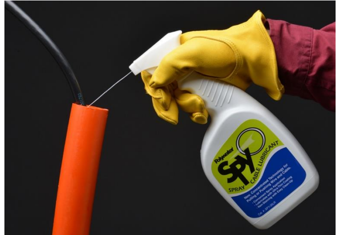
Polywater Spy can be sprayed directly into ducts or onto cables

Coefficient of friction data on additional or specific cable jackets or conduits can be obtained from American Polywater Corporation.