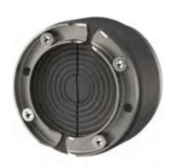
PHSD Super Segmented Ring Technology for Single Cables and Ducts