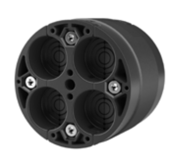
PHRK SSG with Super Segmented Ring Technology

For more information on Polywater | Hauff-Technik please visit https://polywater-haufftechnik.com/