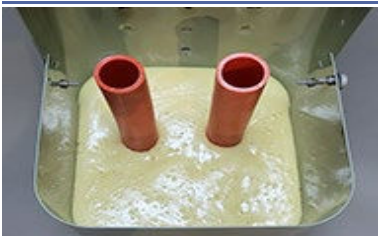
Fill gaps with FST-BP or PFP

PedFloor Plus should rise between cables/conduits if an even application is not possible.