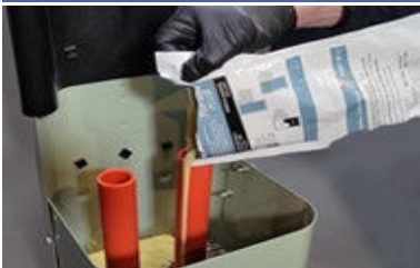
Apply PedFloor Plus

The bag should begin to expand and warm slightly before you pour out the material.