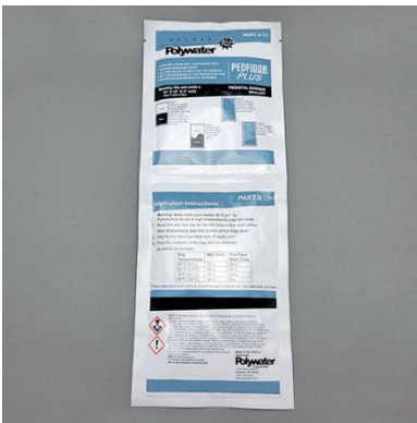
PedFloor Plus Burst Pack

BE SURE TO HAVE A SLICING DEVICE AVAILABLE TO CUT OFF A CORNER OF THE BAG IF THE TEAR NOTCH FAILS