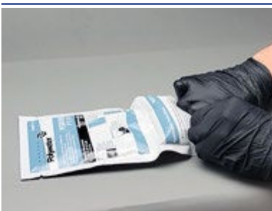
Burst primary seal