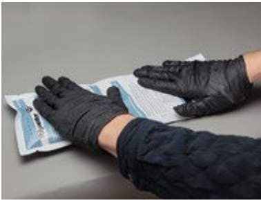
Knead burst pack