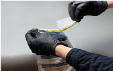
Tear corner of burst pack

Mix well. Two parts should be fully combined for best results.