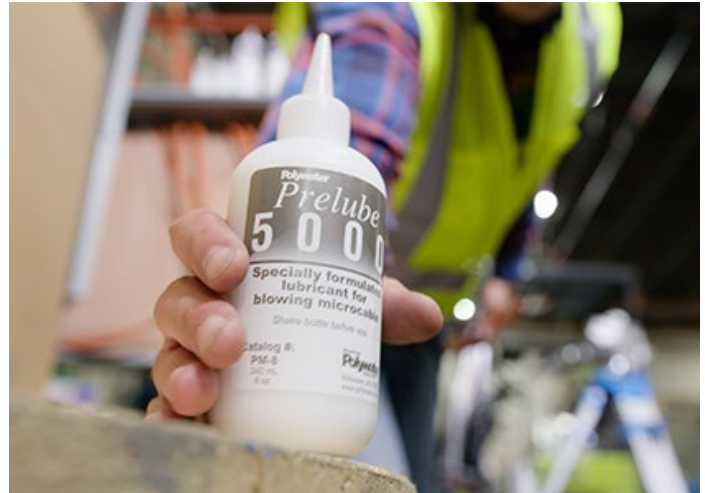
Prelube 5000 applied to duct prior to blowing fiber cable