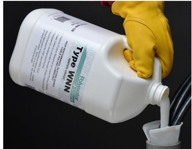
Polywater + Silicone Lubricant is easy to pump or pour into conduit.