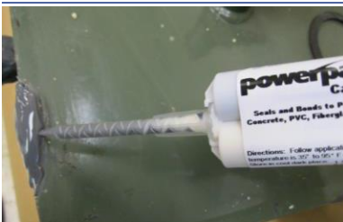
Apply PowerPatch over Putty patch or leak area

The PowerPatch should be a uniform light gray color with no streaking when it comes out of the mixing tip.