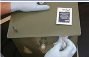
Clean area with cleaning wipe before applying sealant