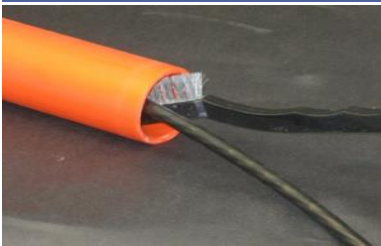
Clean duct with wire brush.