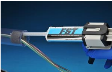
Inject foam sealant.

Place static mixer onto cartridge and lock into place by twisting 90° clockwise. Depress handle on dispensing tool until FST comes out of static mixer tip. Pump a small amount of material through static mixer until an even mixture is dispensed. Discard this excess material.