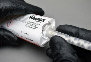
Attach static mixer.

Place the cartridge into dispensing tool (Cat # TOOL-50-11) and snap it into place. See instructions on page 4 for use information on the dispensing tool.