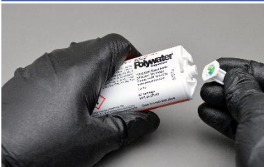
Replace cap to reuse cartridge.