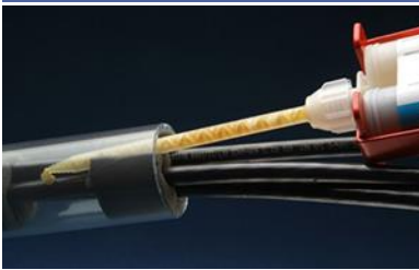
Dispense foam sealant