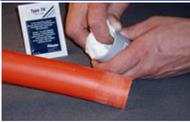
Clean Coupling and Conduit with Cleaning Wipe