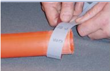
Square Conduit End

For conduit over 3 inches (75 mm) in diameter, taper the end at a 45° angle with a rasp or knife. This aids conduit insertion into the coupling.