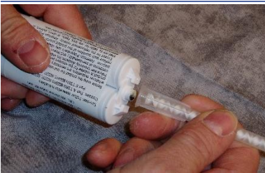
Attaching Static Mixer