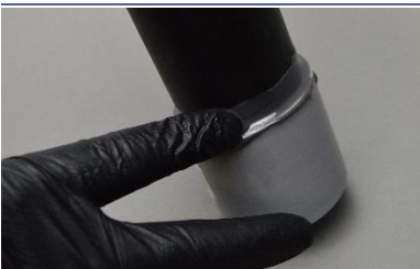
Smoothing BonDuit on coupling