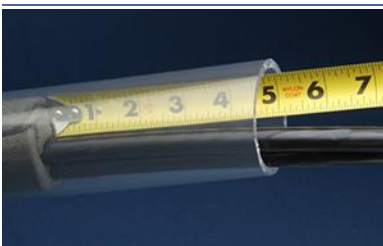
Insert foam 5 inches

Optional instructions sample: For active leaks, apply Polywater® Stick Putty to temporarily plug the fluid.