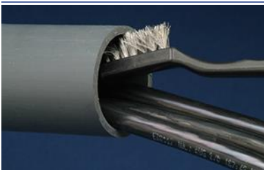
Clean duct with wire brush, solvent wipe