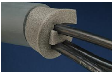
Separate cable(s) then wrap with foam strip

Note: Steel type conduit must be sanded and cleaned.