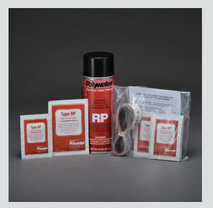
Type RP package options