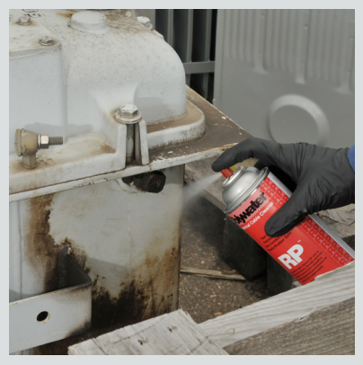
Removing transformer oil residue