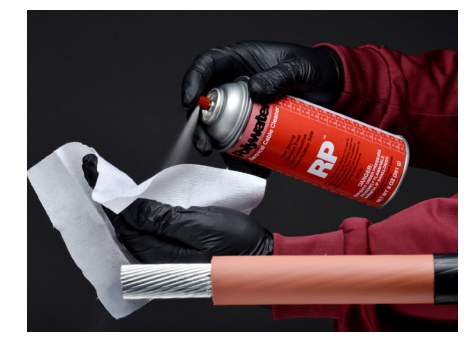
Catalog # RP-16