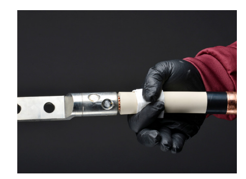
Lint-free wipes leave no residue

Polywater<sup>®</sup> Type RP<sup>™</sup> Rapid Power medium voltage cable cleaner evaporates quickly without the health and safety issues of other volatile cable cleaners. Type RP is packaged several ways to make cleaning and maintenance safer and easier.