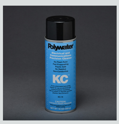
Catalog # KC-16