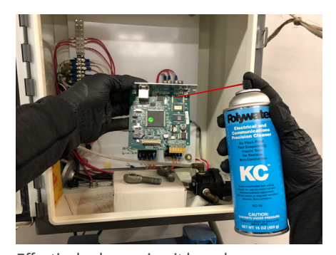
Effectively cleans circuit boards

Polywater® KC™ Electrical Contact & Equipment Cleaner can be used to clean busbars, breakers, controls, switches, substation relays, meters, traffic control electronics, cables, etc. It effectively cleans oxidation, dust, light oils, flux residue, and condensation from electrical equipment.