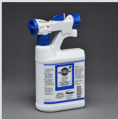
One-quart hose adaptor refillable bottle