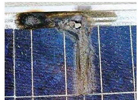
Eliminate hotspot damage