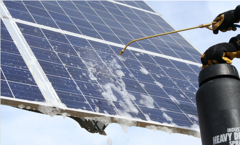
Polywater SPW sprayed onto panel surface

An Effective, Safe, and Economical Cleaner for Photovoltaic (PV) Panel Installations