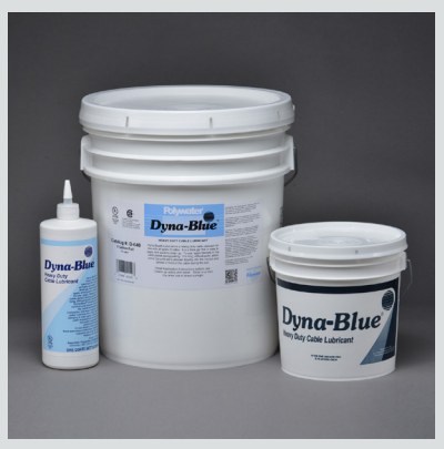
Dyna-Blue packaging (drum not pictured)