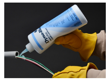
Excellent choice for service work