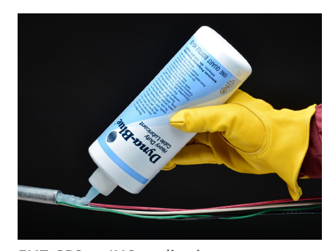
EMT, GRS, or IMC applications

Dyna-Blue® Lubricant is clean, dries slippery, and won't separate out. The thick gel is compatible with common electrical cables and has "clingability" for easy handling and application. It is a good lubricant for everyday use when installing THHN, XHHW, and fire alarm cables.