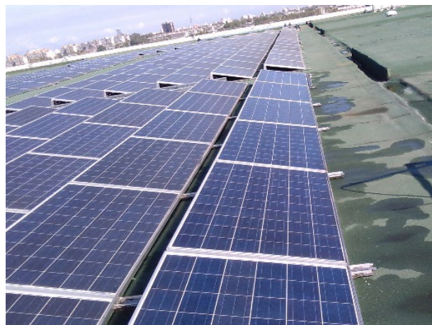
Polywater's Solar Panel Wash is safe for users and the environment.

For more information, please see the Solar Panel Wash Water-Saving White Paper .