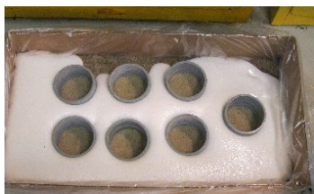
PedFloor flows and expands after 20 minutes

PedFloor is engineered with a time delay that allows the material to flow throughout the target area. As the surface is covered, it expands and cross-links into its final, durable form. It will naturally flow into small spaces without need for troweling.