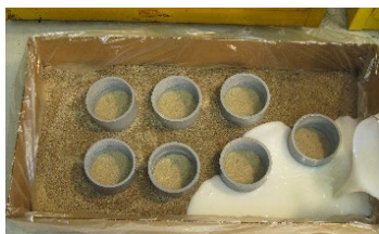
PedFloor is mixed and poured

PedFloor is easy to install. It flows into the target area and expands into voids.