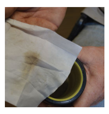
Effectively removes contaminants prior to electrofusion.

*When VOC regulations do not allow the use of alcohol, the Polywater ACE™ acetone wipe is the best industry alternative. This water-free solvent wipe also offers excellent cleaning with no residue.