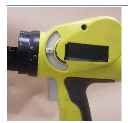
4. Place the PowerPatch cartridge into Power Caulking tool. Adjust dispensing speed to half. Higher speeds may cause the tool to auto shut off.

Twist cap counterclockwise to remove from cartridge.