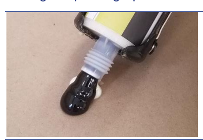
Setting Despensing Speed

5. Depress handle on dispensing tool to prime cartridge each time product is used until both the white and black resins are coming out of the cartridge.