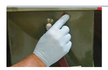
Sand or brush repair area

1. Clean surface with rag or Polywater Grime-Away™ Multipurpose Cleaner Wipes to remove dirt and grime.