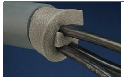
Separate cable(s) then wrap with foam strip