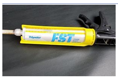
TOOL-250 with FST-250