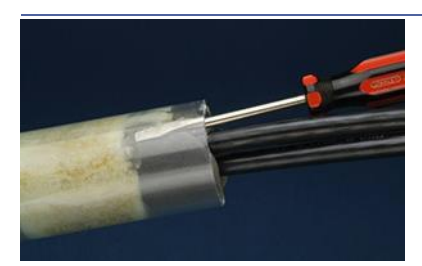
Use screwdriver to check for voids