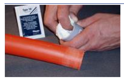
Clean Coupling and Conduit

Clean the adhesion surfaces of both the conduit and coupling with cleaner wipe to remove any oils and displace water. Gloves are recommended.