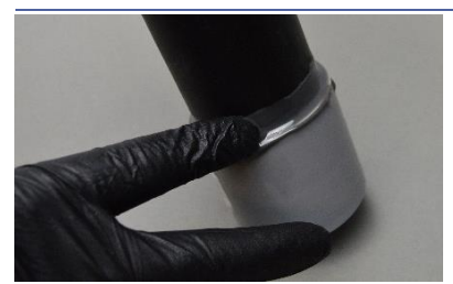
Apply BonDuit Adhesive

7. Apply BonDuit in a 1/8- to 1/4-inch (3 to 6 mm) bead using a zigzag pattern the depth of the connector inserts. The pattern should be about ½ inch (13 mm) in width and extend to the outer edge of the conduit. The end of the static mixer may be trimmed off up to the last notch to place a larger bead for larger diameter conduits.