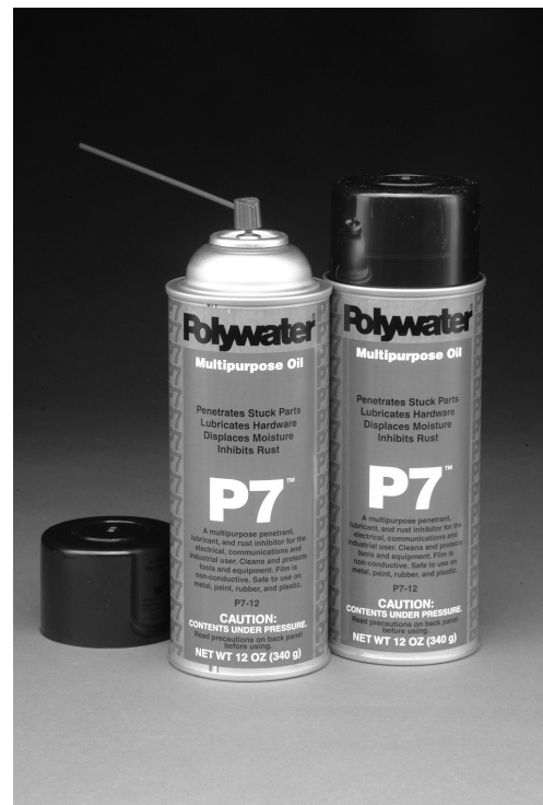
P7™ Multipurpose Oil Aerosol (cat. # P7-12) penetrates into tight spots and frees stuck parts.