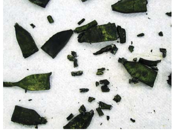
Wax-based lubricants destroyed some low-smoke zero-halogen cable jackets in aging tests.

Cable pulling lubricant compatibility is evaluated using IEEE 1210 test methods. Tensile strength and elongation tests were performed on over 29 different LSZH cable jackets representing a number of manufacturers and LSZH technologies. Cable jackets were aged in the lubricant at the temperatures specified in the standard. Polywater® LZ lubricant showed the broadest compatibility with LSZH cable jackets. Most cable pulling lubricants available through local supply houses had significant and sometimes devastating effects on LSZH cable jackets. Shown at lower right is a photograph where improper cable lubricant choice contributed to LSZH cable jacket failure.