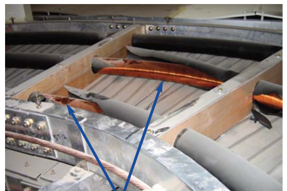
Lubricant residue from an adjacent duct system contributed to LSZH jacket failure.